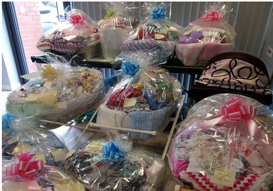
Baskets ready for collection by Health professionals.