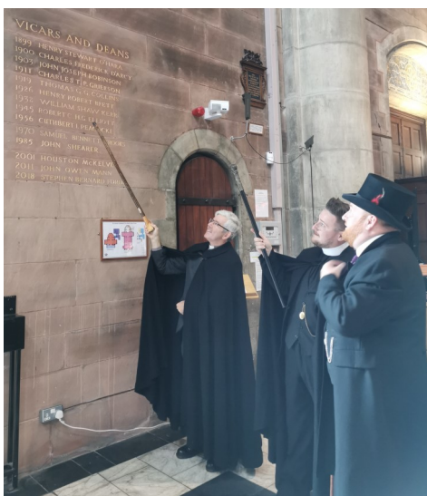
The Dean joins members of the Footsteps NI cast to celebrate the 120th anniversary